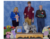
Am GCH Apple Acres Showcase U Got Nothin On Me