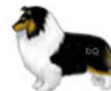
Raisin Ciara ROM