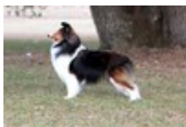
Penmore Blame It On The Boogie RN NA NAJ NF BCAT CGC TKN BN-V