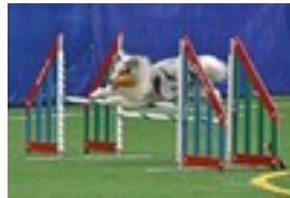
Am Ch MACH2 Jandale Making Sparks Fly RN MXG MJG MXF T2B