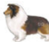
Raisin Born This Way