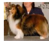
Am GCHB Besame's Wild Thing RA