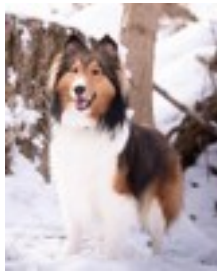
Wickett Bird Is The Apex Word NAJ