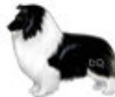
NAC MACH Scene Stealer Shak-A New World MXS MJS