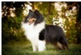
MACH Apex Wildest Dreams CD BN RI HSAds HIAd MXB MJB XF T2B BCAT CGC TKN