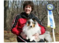
NAC Am Ch MACH7 Bare Cove Blu Lite Special MXC2 MJG2