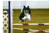
MACH Jandale Lights On Broadway RN MXB MJB